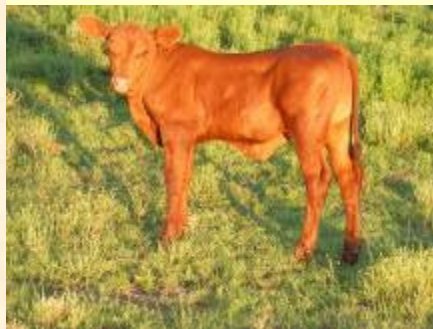
Second cross Senepol/Bonsmara x Senepol bull calf at 2 months — ( note: polled, smooth hair coat, BW 29 kg) Sire KL 07-30 (Senepol) x RO 04-007 (Bonsmara/Senepol)