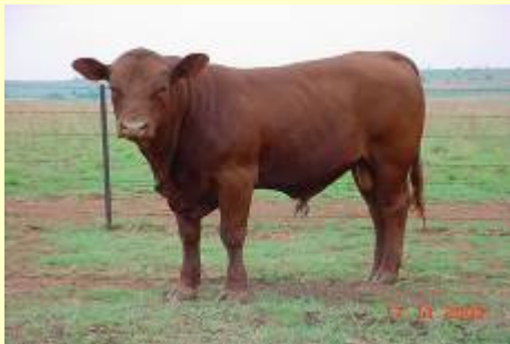
Majuba—one of the first bull calves to be born in South Africa