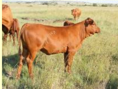
First cross Senepol x Bonsmara heifer at 5 months — ( note: smooth hair coat, BW 31 kg) Sire KL 04-27 (Senepol) x KD 06-004 (Bonsmara)