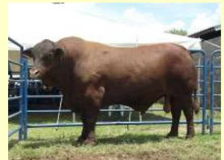
PM 10—at the first National Senepol Auction in 2006 at Bast Plaats, Vryburg

They reached the South African border at around 6.30 a.m. and were refused further entry into South Africa due to the Foot and Mouth disease. No amount of explaining or presentation of the special permission would convince the official on duty that they could